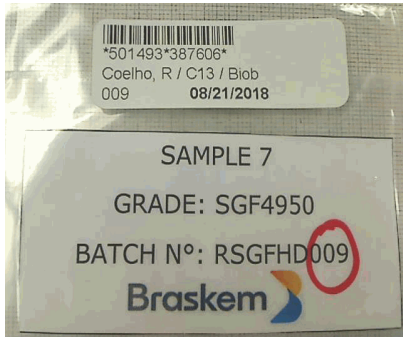
Package received - labeling COC

Laboratory Number Beta-501493 Percent modern carbon (pMC) 101.63 +/- 0.18 pMC Atmospheric adjustment factor (REF) 100.5; = pMC/1.005