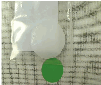
View of content (1mm x 1mm scale)